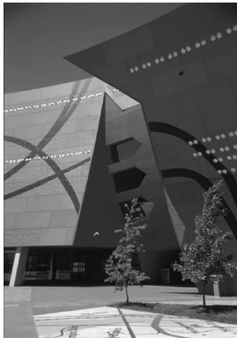
Figure 1. Calligraphic symbols and 'braille' patterns on the surface of the NMA building.

surface, to the conceptual device of the extruded string and red 'knot' which passes through and around and thus generates the building's form, it is relentless in its challenge to conventional institutional architecture (Figs 1 and 2). The issues it raises, sometimes incidentally but most often in a deliberate and provocative manner, are also complex and significant. There is little clear distinc-