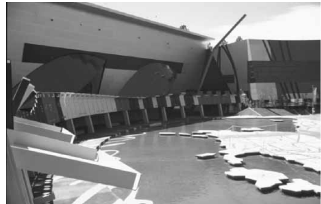
Figure 6. Le Corbusier's Villa Savoye is reversed and reconstituted in black corrugated steel, as part of the Institute of Aboriginal and Torres Strait Islander Studies.

Savoye, is reversed and reconstituted in black corrugated steel. The fact that this forms part of the Institute of Aboriginal and Torres Strait Islander Studies is a hint of the building's clear, even dangerously frank, employment of colour symbolism.