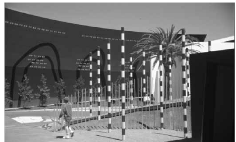
Figure 3. The constructed landscape of the Garden of Australian Dreams, designed by the Perth firm Room 4.1.3.

completion, unity, and wholeness. In its exhibition policy, the NMA abandons an authoritative version of history in favour of multiple stories, of ordinary as well as extraordinary people; and the nationalism embodied there is of the most diffident, self-effacing type. Where a museum's contents are not solely cultural 'treasures', there is also less need for the 'museum as vault' typology, and the contents of the NMA are decidedly mixed in this respect. Indeed, if a national museum is seen to 'house' the stories of the nation, there was good reason for the NMA to make allusions to domestic architecture, the architecture of the familiar, mundane, and everyday. This strategy is particularly clear in the relationship of the NMA building with its own 'backyard'. Given the building's relatively small scale, both upon the Acton peninsula site and as viewed from across the lake, the architects have designed a thin and annular building, pushed towards the perimeter of the lake shore. On the inside, this has created a semi-enclosed 'Garden of Australian Dreams', with a remarkable (and equally controversial) landscape design by the Perth firm, Room 4.1.3 (Fig. 3).