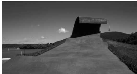
Figure 4. Visual jokes in the museum include the 'Uluru line', a 'string' heading from the museum towards Central Australia, which has snapped and recoiled.

On the face of it, the NMA seems to fit the 'theme park' model in a relatively uncomplicated way. To state the obvious, a museum in the theme park mould might be expected to have an emphasis on entertainment, possibly directed at school-aged children, and to reflect its light-hearted tone in spectacular or at least unconventional architecture. It might be expected, in a word, to be populist. The mausoleum model, on the other hand, implies an institution that is solemn and educational, perhaps reflected in a conventionally monumental institutional architecture. But I would argue that taking the NMA as a simple exemplar of the 'theme park' type would be a misapprehension, or at least an oversimplification, and indeed that the building problematises the very question of popularity in aesthetic terms. This leads to a proposition: that there is a 'look' of populism that exists independently of any intended or actual popularity, or even a connection with popular culture. I would argue that the NMA opens an elaborate play on this 'look' of the popular, and that it does so by manipulating certain key aesthetic devices: bright colour, literal and figurative elements, visual jokes and non-orthogonal forms, for instance; and I will return to some of these in more depth (Fig. 4). Such devices carry a weight of expectation and association, they