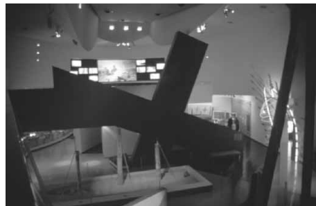
Figure 7. The representation of monumental solemnity: interior view of the Gallery of the First Australians with 'cross' stair.

I have, by now, drawn upon a whole series of binary oppositions: between high and low, elite and popular culture, the museum as entertainment and edification, monumental and anti-monumental, 'lively' and 'deathly' architecture, and vanguard and avant-garde approaches to art (Fig. 7). This series threatens to expand interminably. But while up until now I have proceeded as though the oppositions were loosely synonymous, and gathered their terms under the sign of the 'mausoleum' and 'theme park' respectively, this in itself calls for further examination. There is not sufficient space here to make the necessary fine distinctions between them, but it must be said first, that the terms of the oppositions are not entirely synonymous, and more importantly, that there is a convergence between the two ends of the spectrum. This, then, is my point: that the NMA manifests both sides of many of the oppositions I have mentioned, not in an attempt to resolve or to smooth them over, but in order to problematise and render them explicit. This is proven by the fact